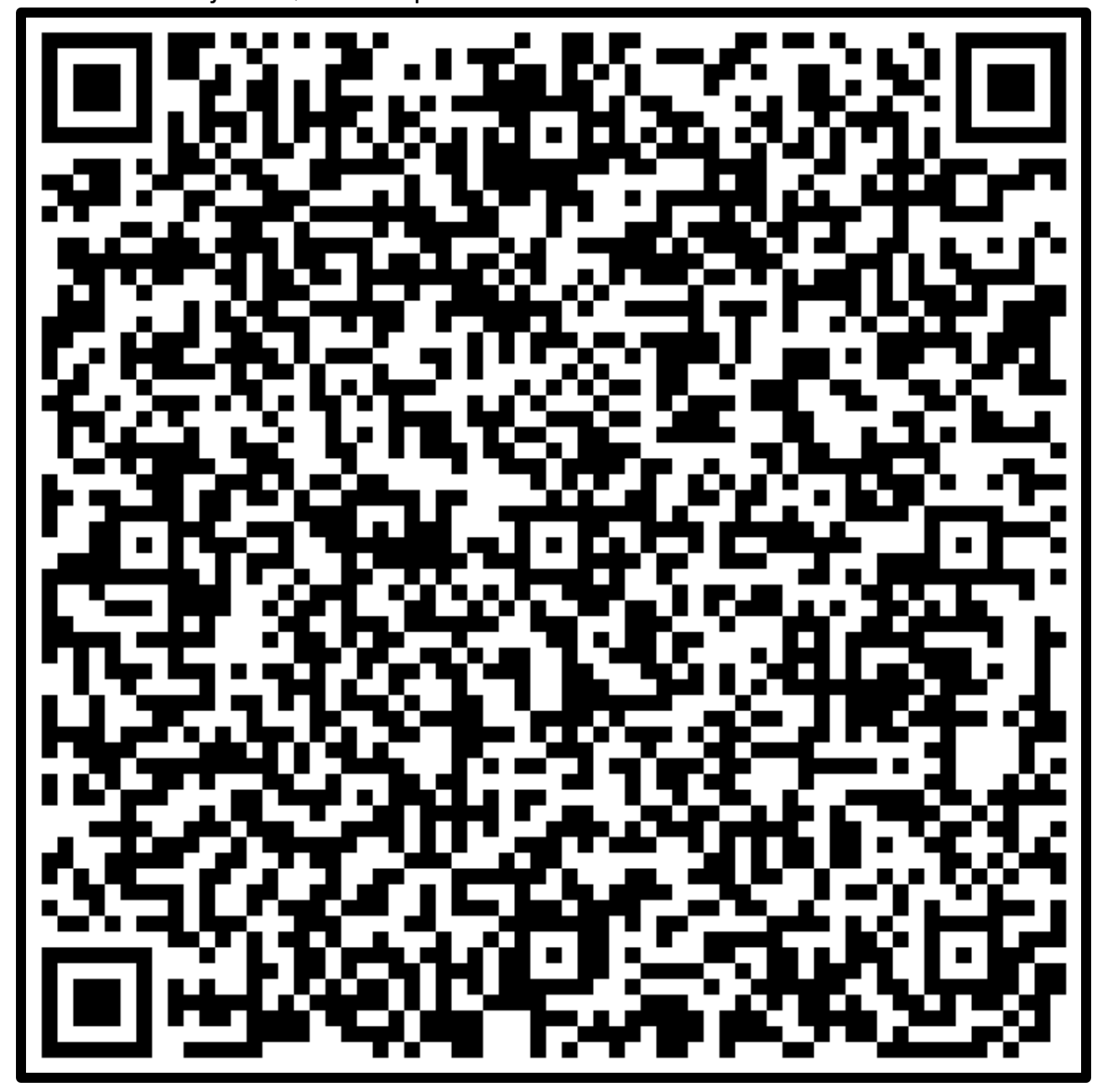
Zadanie 5 – rozetnij ten QR kod na puzzle

Kod do kłódki (schowaj w pobliżu tablicy)